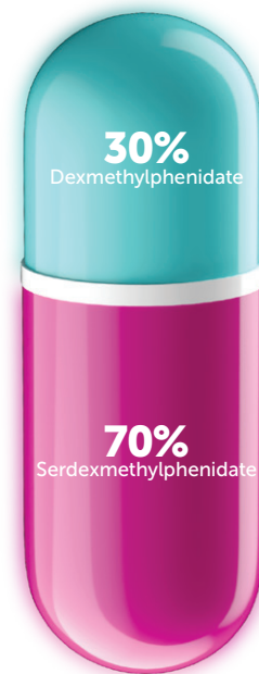
Not actual size.

1 Starts working quickly to help in the morning